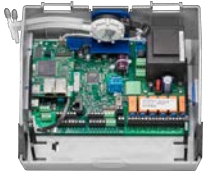
TROX UNIVERSAL controller with integrated EM-V