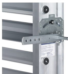
QUADRANT STAY FOR JZ- AL AND JZ-HL-AL

The quadrant stay is situated between the first two blades from the top