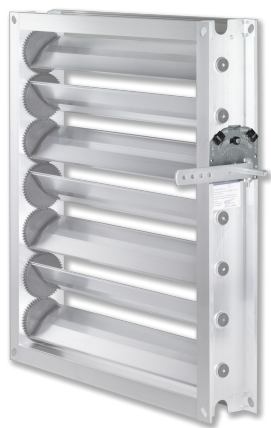
QUADRANT STAY FOR JZ-AL