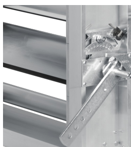
QUADRANT STAY WITH

The quadrant stay is situated on the first blade from the top (dampers with up to three blades) or on the third blade from the top (dampers with at least four blades)